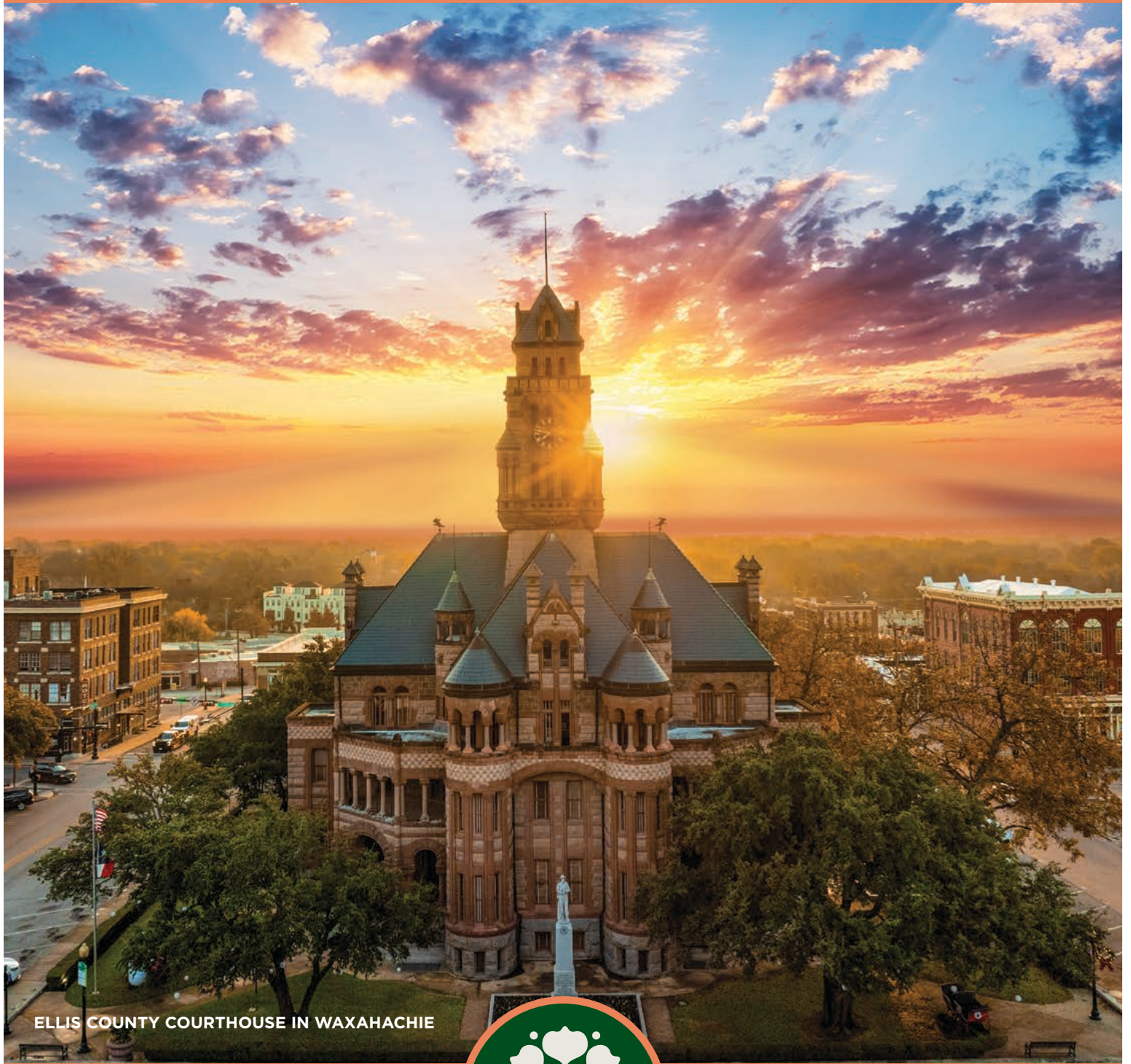
ELLIS COUNTY COURTHOUSE IN WAXAHACHIE