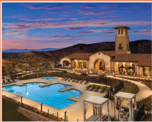
TERRAMOR – LOS ANGELES

In 2025 Starwood Land acquired 11 master-planned communities comprising more than 16,000 homesites and 600 acres of commercial property in three of the Top Ten largest U.S. new home markets – Dallas, Houston and Austin. In 2025, for the third consecutive year, Starwood Land's Sunterra in Houston is the #1 selling community in Texas.