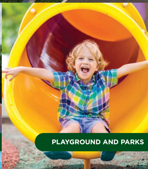
PLAYGROUND AND PARKS