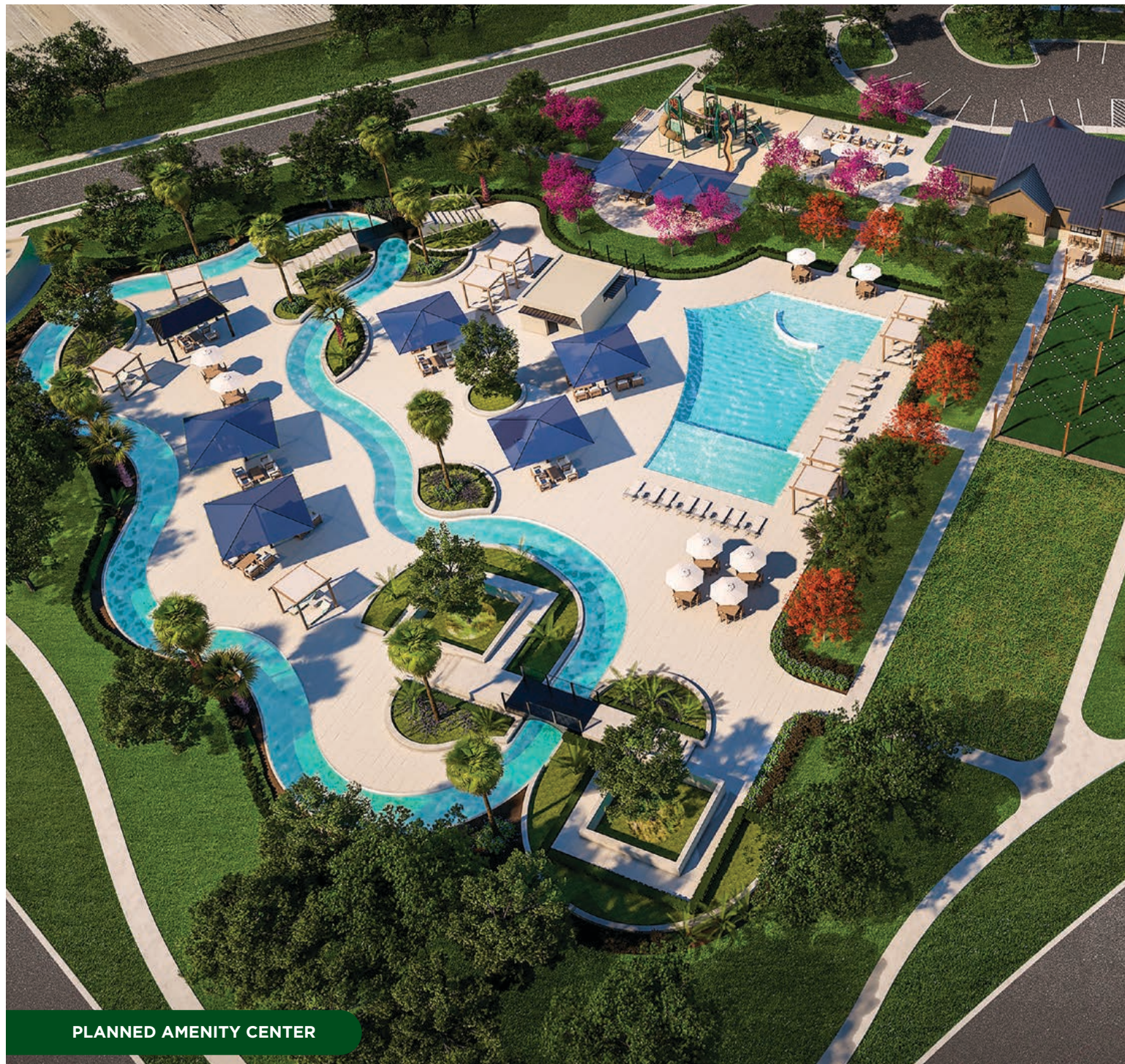
PLANNED AMENITY CENTER