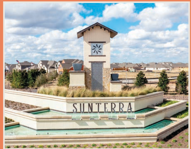
SUNTERRA – HOUSTON